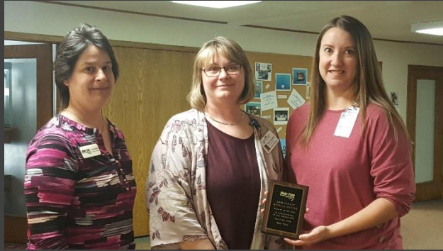
Partner of the Year - Door County Medical Center

Door-Tran's Annual Meeting was held on Tuesday, April 24th at Prince of Peace Church. We recognized several volunteers for five years of service, Volunteer of the year award, Board Member of the Year and Partner of the Year .